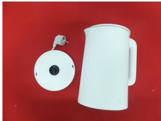
Mi Electric Kettle